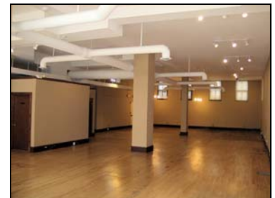
75 S LaSalle Interior:

3561 St Annes Ct, Suite #100, Aurora, IL 60506 (630) 499-9860 Fax (630) 499-9088